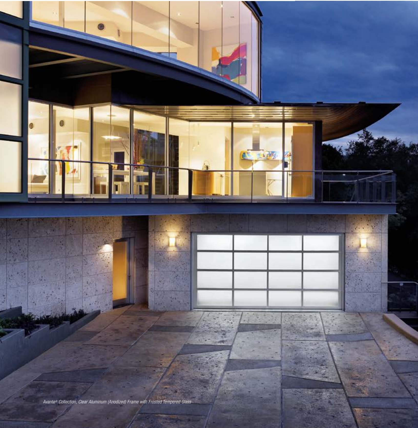
Avante® Collection, Clear Aluminum (Anodized) Frame with Frosted Tempered Glass