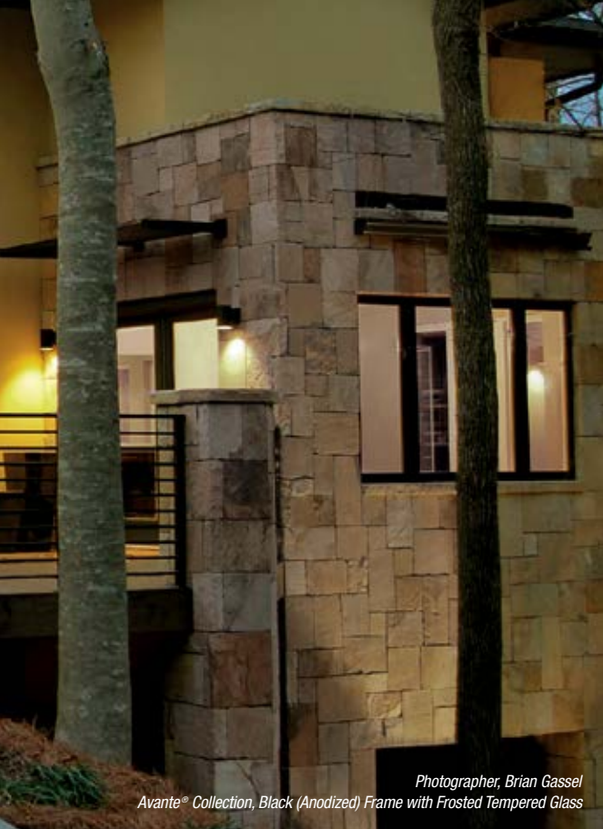
Avante® Collection, Black (Anodized) Frame with Frosted Tempered Glass