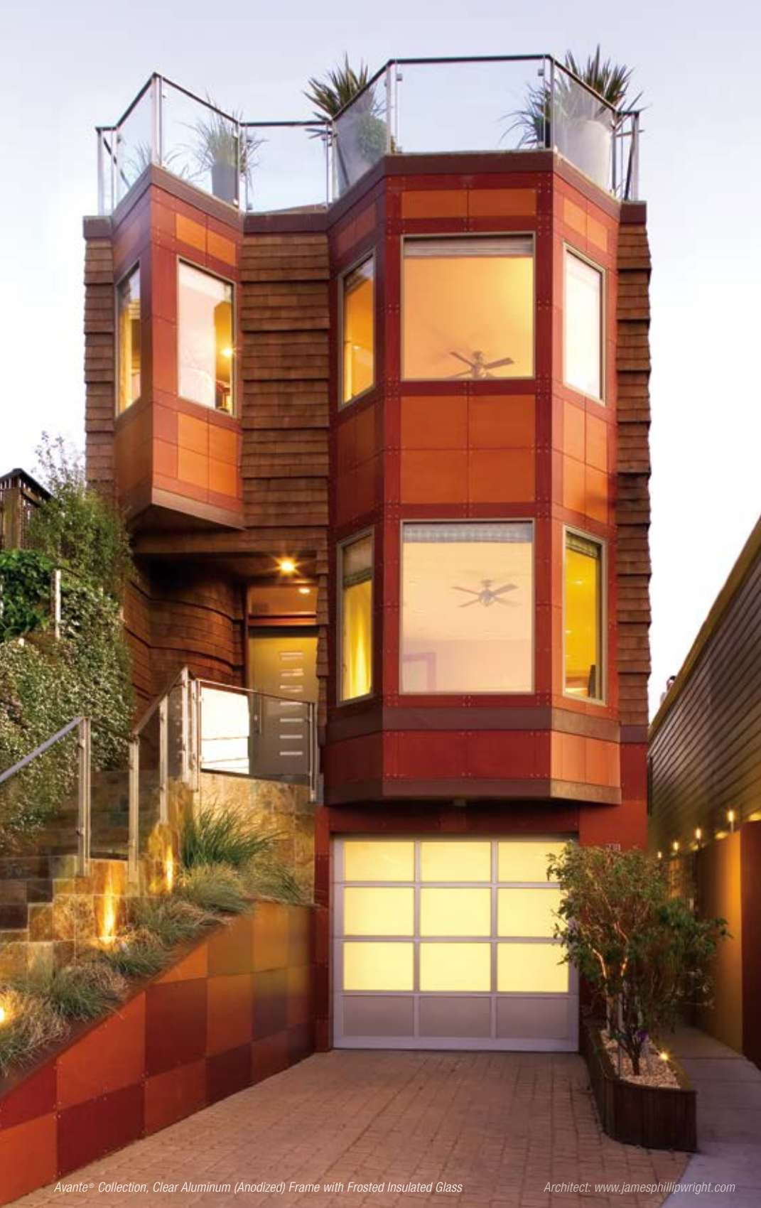
Avante® Collection, Clear Aluminum (Anodized) Frame with Frosted Insulated Glass